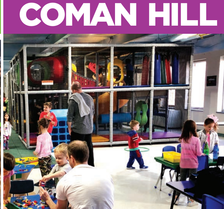
Coman Hill Indoor Educational Playground - Fostering wellness for young minds and bodies BEYOND traditional classroom spaces.

With your support, we funded new ways to learn - like FUNdations for fast-track reading at Coman Hill and Challenge Success to help our middle and high school students manage stress.