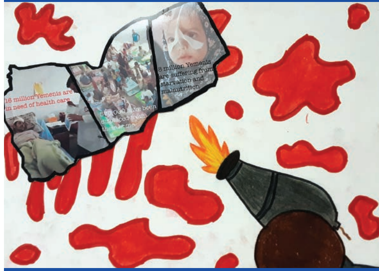
Global Competency and the Global Scholars program -Teaching BHHS students to think BEYOND our backyard.