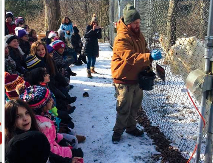
Howling with the Wolves Field Trip - Taking learning BEYOND the classroom by visiting the Wolf Conservation Center to study wolves and explore environmental interdependence.