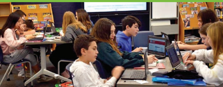
HCC Library 2.0 - Reaching BEYOND the ordinary library to integrate STEAM and Makers Spaces, update presentation technology, and create active learning spaces.